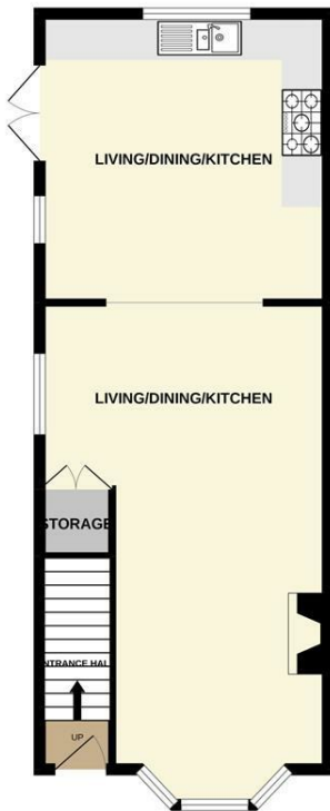
GROUND FLOOR 526 sq.ft. (48.9 sq.m.) approx.